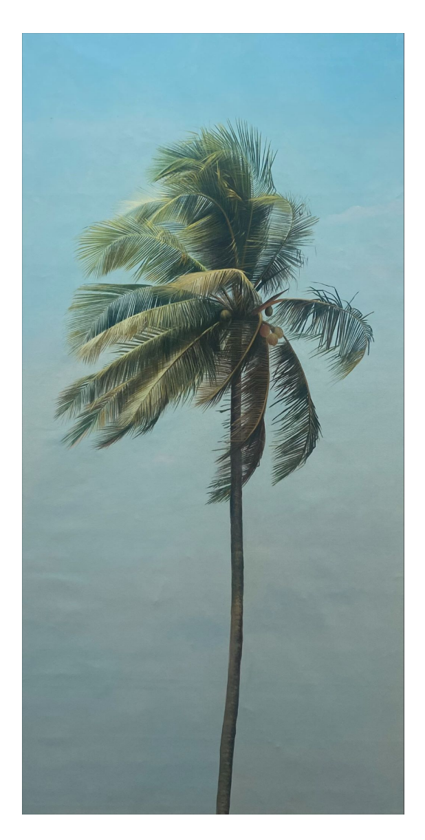
PETER HOFFER Untitled, 2022 Acrylic, oil and resin on board 70.8 x 37.4 in (180 x 95 cm) Unique artwork INV Nbr. hofp_488